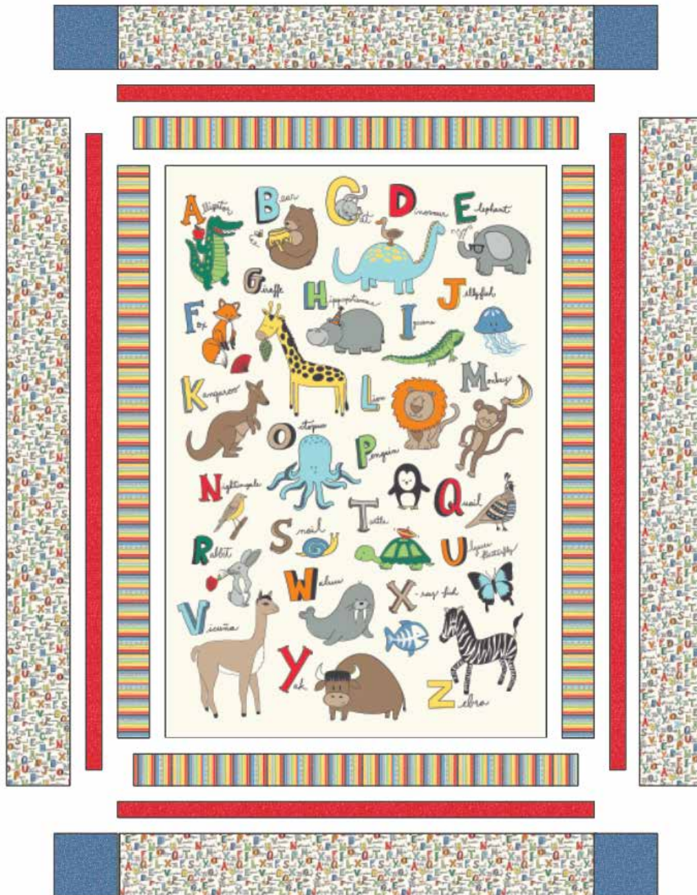
Quilt Assembly Diagram