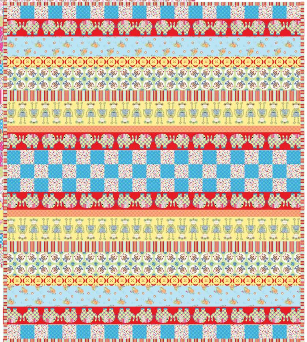
Little Boy Quilt