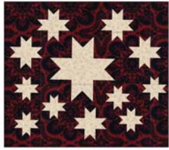
Stars Placement Diagram